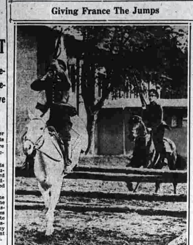
Although it cannot be called military training, the activity in Germany shown here is causing uneasiness in France as the Saar autonomy election nears, with four of a Nazi patch growing. The German policemen are shown as they practice shooting at a target from the backs of jumping horses.

Washington, Nov. 3.—(AP)—The settlement provides a closed shop for the Building Service Employees International Union and other unions. The settlement provides a closed shop for the Building Service Employees International Union and other unions.